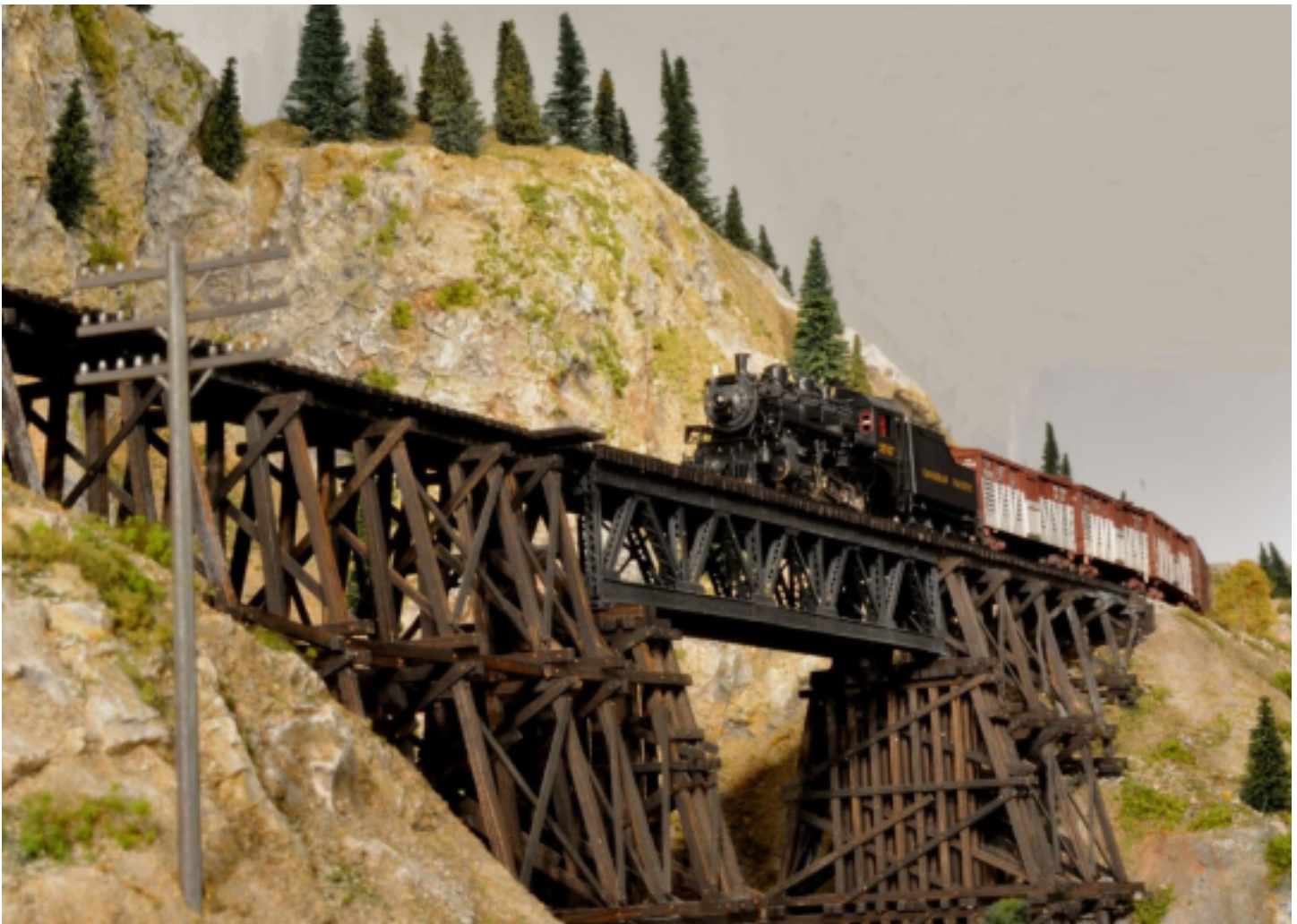
ABOVE: A westbound freight crosses the Bridal Falls Trestle in the Upper Coquihalla Canyon on Anthony Craig's Kettle Valley Division. This layout will host a operating session in the upcoming Railway Modelling Meet of BC.